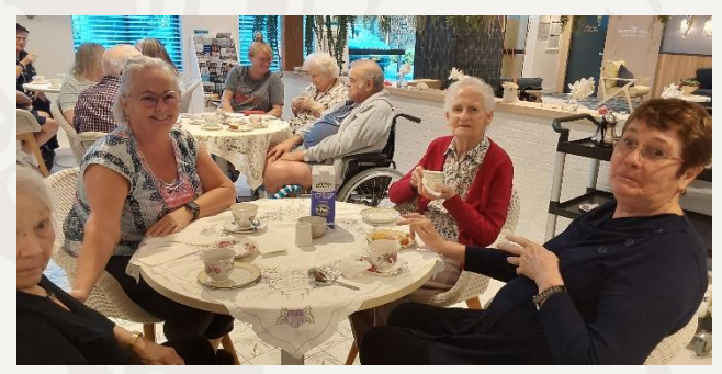
To celebrate Mother's Day every resident received chocolates with the compliments of Thompson Health Care. Many attended a special afternoon with family.