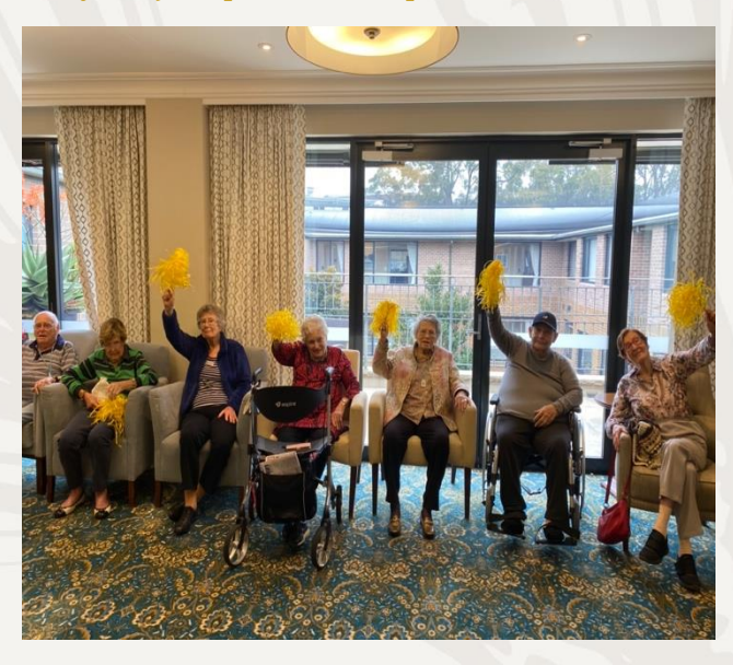
Our cheer squad - Interfaculty carpet bowls